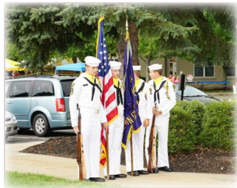
The US Naval Sea Cadet Corps, Harlan R. Dickson Division from Londonderry, NH, presented the colors again this year to kick off our Walk and Fun Run.

Please enjoy these photos from last year's event!