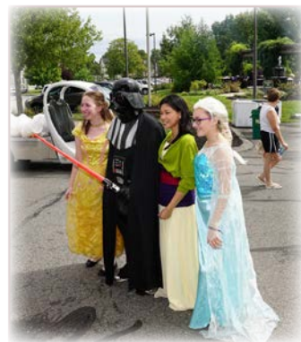
The Disney princesses and Darth Vader visited with our carnival guests, much to their delight.