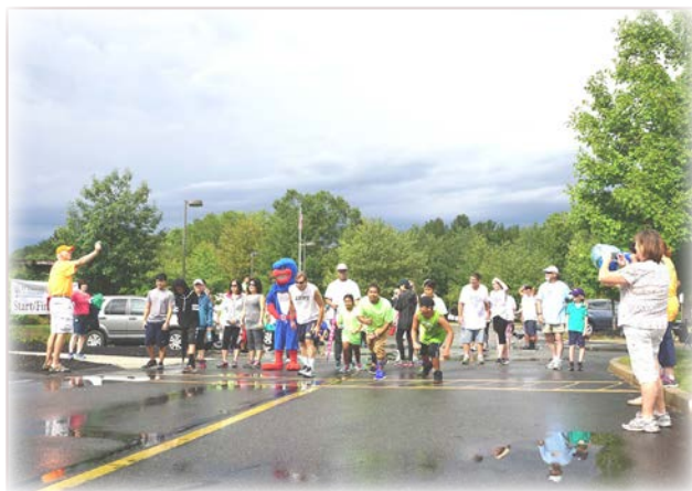
The early rain did not dampen the spirits of our walkers and runners. After braving the rain, we had a beautiful summer afternoon.

Thank you the Busted Knuckles Car Club for hosting our classic car show.